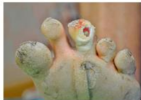
Infected, draining ulcer

(Source: Diabetes Foot Care Clinical Pathway AHSAlbertahealthservices.ca/scns/Page13331.aspx)