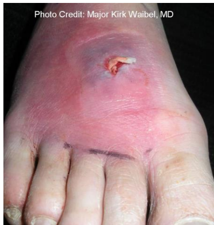
Red, hot, swollen foot