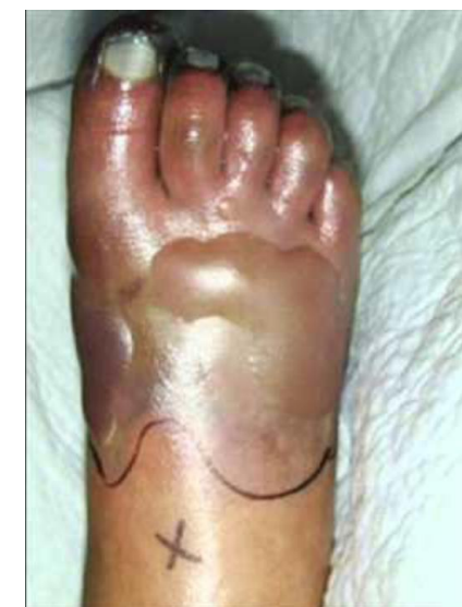
Gangrene insufficient tissue death from blood circulation. Wet gangrene describes tissue death with an active infection. (source: Wet gangrene health education, infection control (icsp). Youtube)