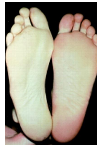
Acute Ischemia: Pain, marble white foot or leg (left of picture) compared to the other, absent pedal pulses in patient with acute ischemia.