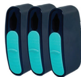
F FRIO Mini Sharps Bin (Pack of 3) Holds 25 pen needles per bin

Inner dimensions: 13cm (H) x 13cm (W) / 5" (H) x 5" (W)