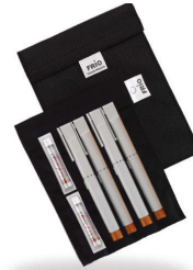
B FRIO Large Wallet 5 pens; or, mix of pens and cartridges

Inner dimensions: 18cm (H) x 7cm (W) / 7" (H) x 2.75" (W)