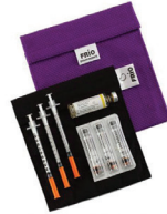
C FRIO Small Wallet cartridges/vials only

Inner dimensions: 19.5cm (H) x 13cm (W) / 7.5" (H) x 5.25" (W)