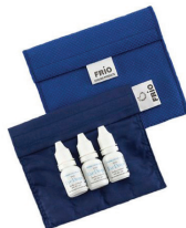
E FRIO Eye Drop Wallet (3 Bottle) 3 bottles

Inner dimensions: 16.5cm (H) x 19.5cm (W) / 6.5" (H) x 7.75" (W)