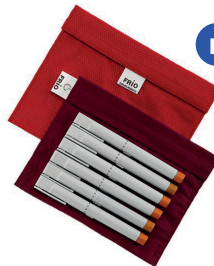
D FRIO Extra Large Wallet 8 pens; or, mix of pens and cartridges

Inner dimensions: 16cm (H) x 13.5cm (W) / 6.25" (H) x 5.25" (W)