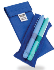
A FRIO Duo Wallet 2 pens; or, 1 pen and 2 cartridges

Inner dimensions: 18cm (H) x 7cm (W) / 7" (H) x 2.75" (W)